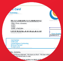
Preview of statement (first page)