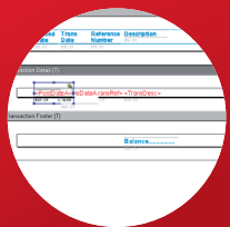
Transaction line formatting