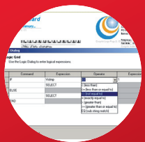
Conditional logic dialog