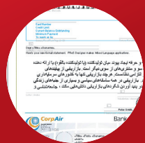
Multi-language support including Arabic